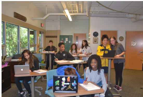
Middle Schoolers are enjoying their new standing desks and dynamic learning space.