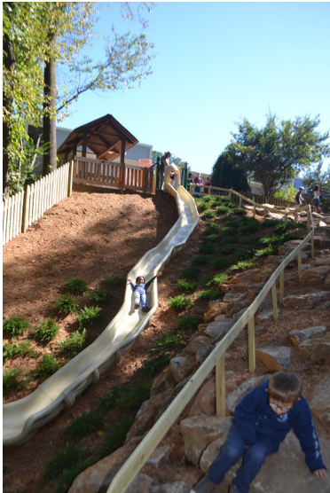
The new giant slide continues to be a student favorite!