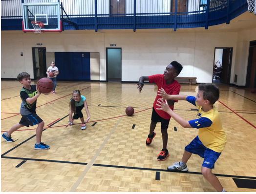
Springmont had its first basketball team this year!

We're so glad you asked! Here's a photo review of some exciting developments!