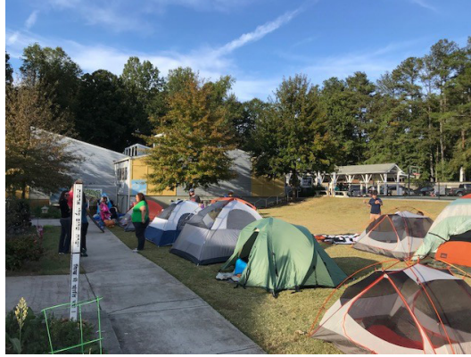
Students and parents enjoyed two campouts on campus – one in the fall and one in the spring!