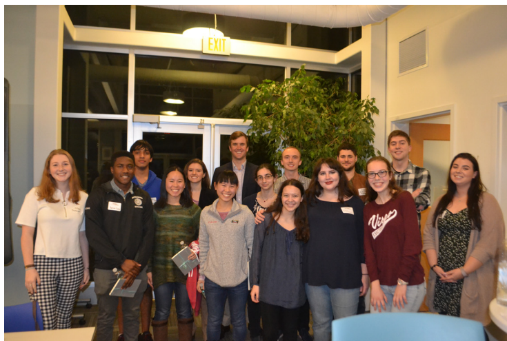
Alumni gathered on campus January 11th for an Alumni Panel to share their experiences at Springmont and beyond.