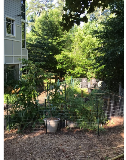
Our vegetable and herb garden has grown quite large.